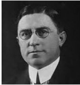
Louis T McFadden

“The conscious and intelligent manipulation of the organized habits and opinions of the masses is an important element in democratic society. Those who manipulate this unseen mechanism of society constitute an invisible government which is the true ruling power of our country... We are governed, our minds are molded, our tastes formed, our ideas suggested, largely by men we have never heard of.” – Edward Bernays (“the father of public relations”), Propaganda , 1928 (note that Bernays’ book, Propaganda , begins with the above quote).