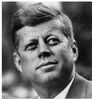
John F. Kennedy

“In the councils of government, we must guard against the acquisition of unwarranted influence, whether sought or unsought, by the military industrial complex. The potential for the disastrous rise of misplaced power exists and will persist. We must never let the weight of this combination endanger our liberties or democratic processes. We should take nothing for granted. Only an alert and knowledgeable citizenry can compel the proper meshing of the huge industrial and military machinery of defense with our peaceful methods and goals, so that security and liberty may prosper together.” – Dwight D. Eisenhower, 34th President of the United States,, January 1961 Speech