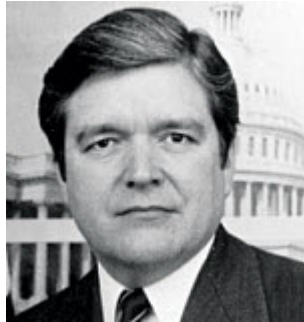
Larry P McDonald

operations. Its preparations are concealed, not published. Its mistakes are buried, not headlined. Its dissenters are silenced, not praised. No expenditure is questioned, no rumor is printed, no secret is revealed.” — John F Kennedy, 35th President of the United States, from a speech delivered to the American Newspaper Publishers Association on April 27, 1961 and known as the “Secret Society” speech ( click here for full transcript and audio ).