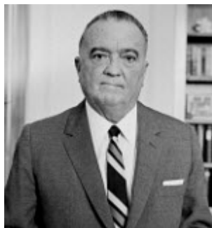
J. Edgar Hoover

“Today the path to total dictatorship in the U.S. can be laid by strictly legal means... We have a well-organized political-action group in this country, determined to destroy our Constitution and establish a one-party state... It operates secretly, silently, continuously to transform our Government... This ruthless power-seeking elite is a disease of our century... This group...is answerable neither to the President, the Congress, nor the courts. It is practically irremovable.” — Senator William Jenner, 1954 speech