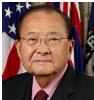
Daniel K Inouye

Congressman Larry P. McDonald, November 1975, from the introduction to a book titled The Rockefeller File .