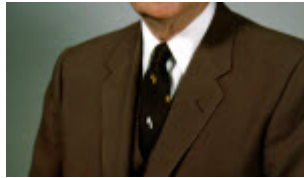
Dwight D. Eisenhower

“In the councils of government, we must guard against the acquisition of unwarranted influence, whether sought or unsought, by the military industrial complex. The potential for the disastrous rise of misplaced power exists and will persist. We must never let the weight of this combination endanger our liberties or democratic processes. We should take nothing for granted. Only an alert and knowledgeable citizenry can compel the proper meshing of the huge industrial and military machinery of defense with our peaceful methods and goals, so that security and liberty may prosper together.” – Dwight D. Eisenhower, 34th President of the United States,, January 1961 Speech