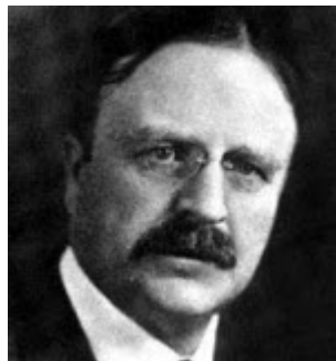
John F Hylan

“Since I entered politics, I have chiefly had men’s views confided to me privately. Some of the biggest men in the United States, in the field of commerce and manufacture, are afraid of something. They know that there is a power somewhere so organized, so subtle, so watchful, so interlocked, so complete, so pervasive, that they had better not speak above their breath when they speak in condemnation of it. ” – Woodrow Wilson, 28th President of the United States, The New Freedom , 1913